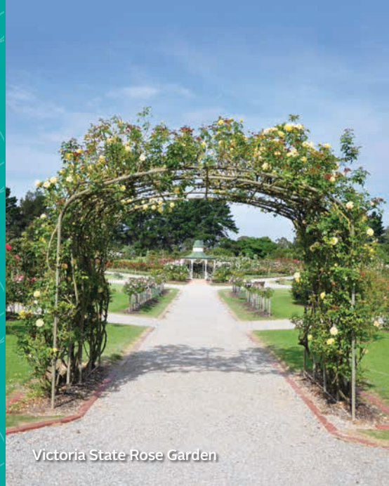
Victoria State Rose Garden