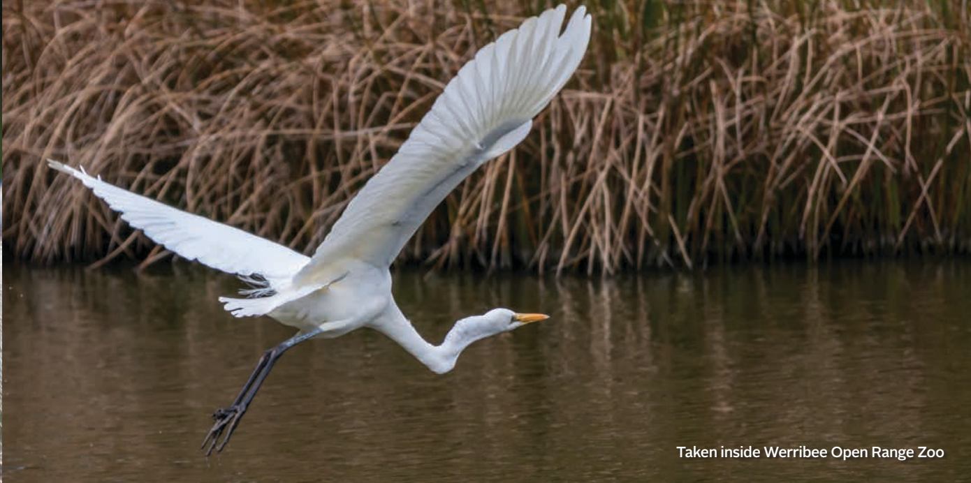
Taken inside Werribee Open Range Zoo