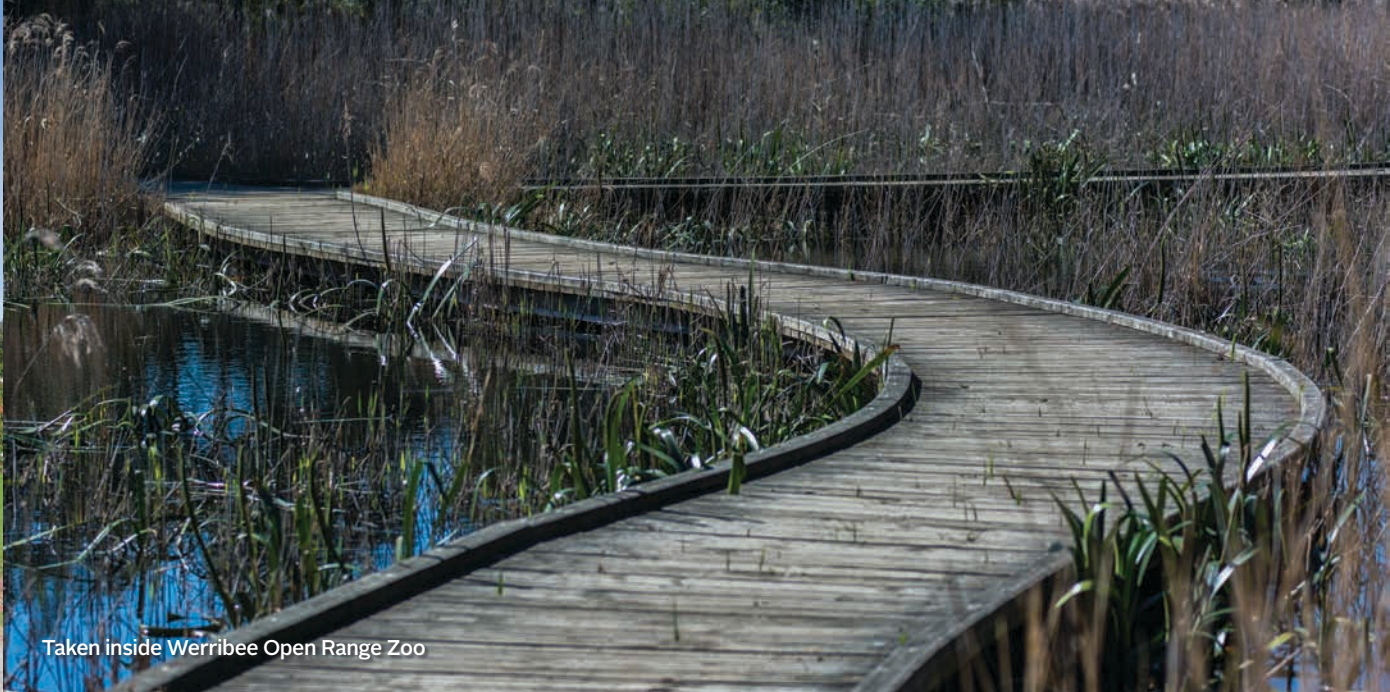
Taken inside Werribee Open Range Zoo