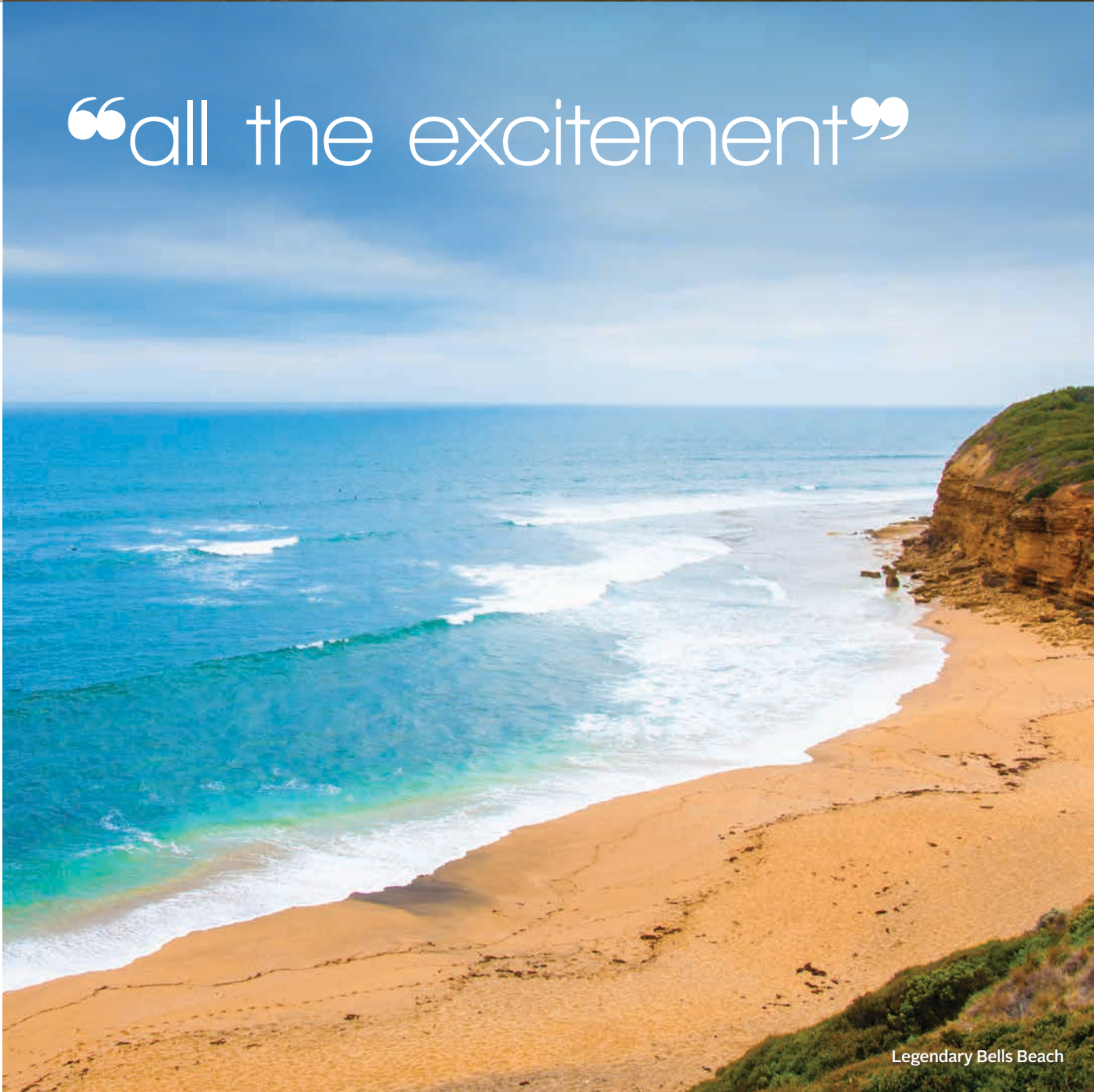
Legendary Bells Beach